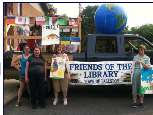
Friends of the Town of Ballston Community Library Flag Day Parade Float 2011