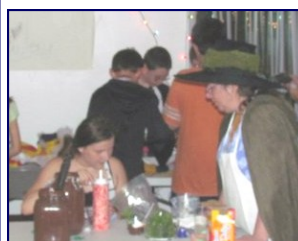
Herbology and the Owlery at the Harry Potter Overnight.

Children and teens learn by exploring and doing. This year 7,743 babies, pre-schoolers, elementary children, teens, parents, and grandparents explored dance, music, reading and writing for pleasure, art, and more at 374 library programs.