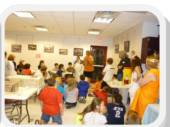
The library won the 2011 SALS Program of the Year Award for the 2010 Camp Half Blood Overnight.