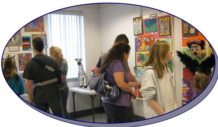
Every April student artwork from the Burnt Hills Ballston Lake Schools is displayed in the library's community room. Local artists and photographers share their art every month.

Community members of all ages have a place to share and learn about such diverse topics as local history, computers, memoir writing, photography and art. More than 1700 people attended over 80 programs and workshops.