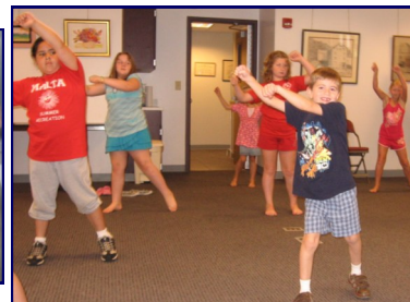
Exploring Dance at the Library