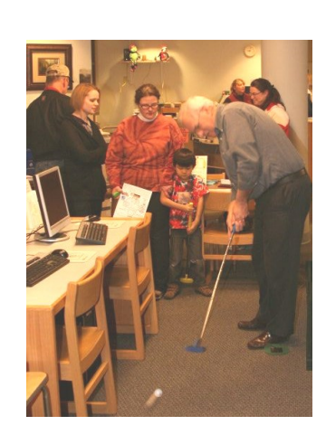
Friends of the Town of Ballston Community Library Mini Golf Fundraiser