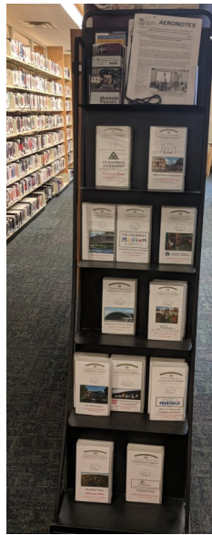
The largest museum pass program in the Southern Adirondack Library System

Membership dues, donations, and fundraising activities help the Friends support programming and resources at the Town of Ballston Community Library.