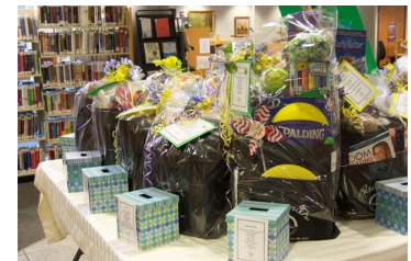
Spring Fling Raffle