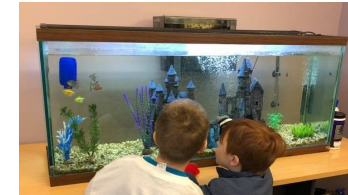
Children's room fish tank