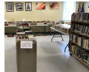
Spring and Fall Book Sale