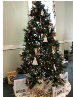
Festival of Trees