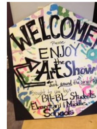
Annual Spring Art Reception for students from the BHBL School District