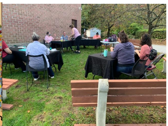
Chalk Couture Adult Program