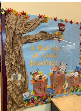
Children's Room Display