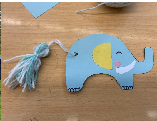
Grab N Go Craft