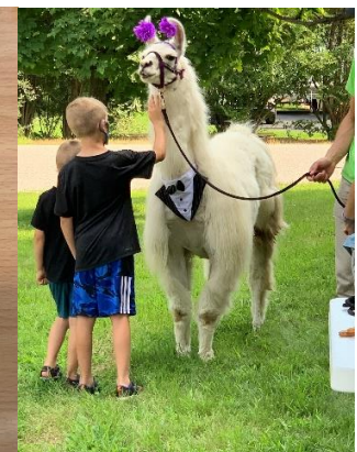
Llamas at the Library