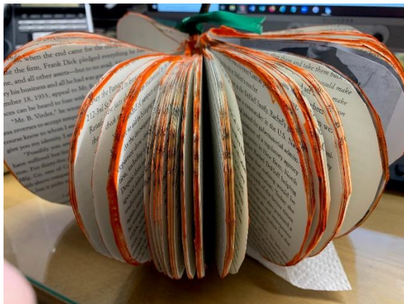
Teen Grab N Go Craft