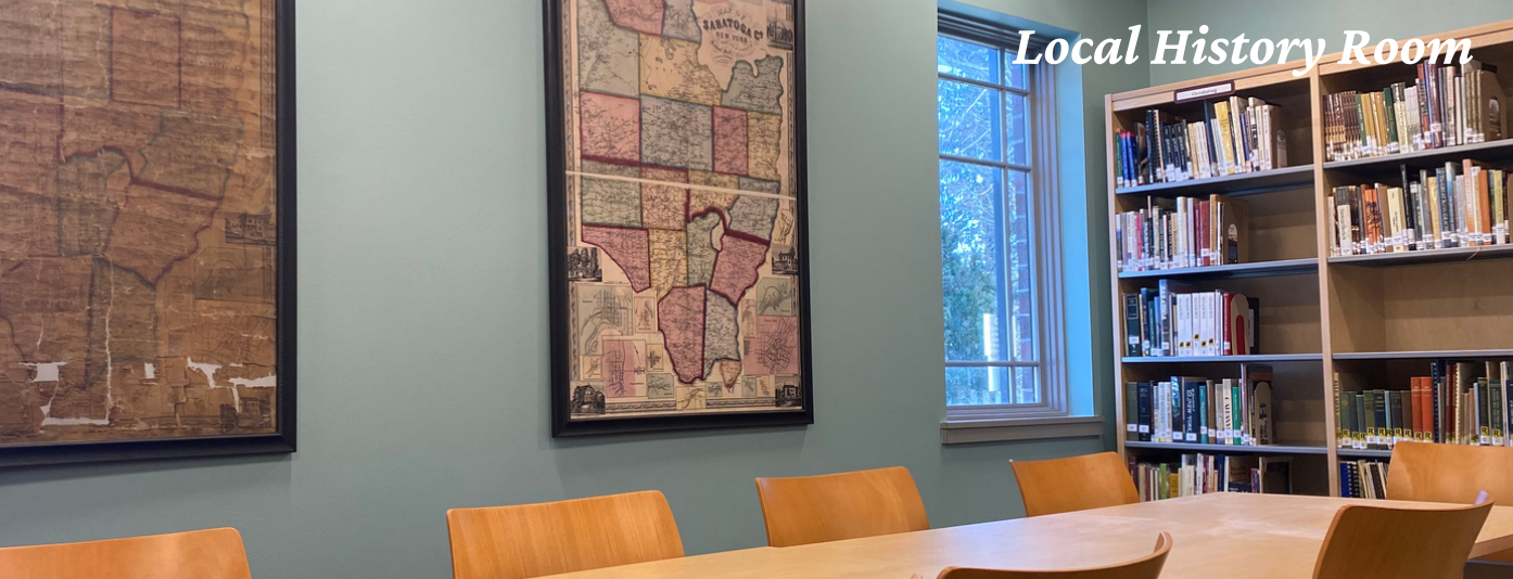
Local History Room